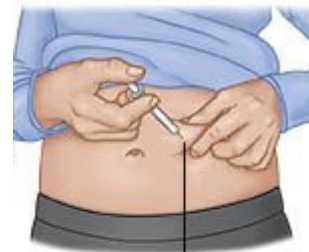
Pinch and inject